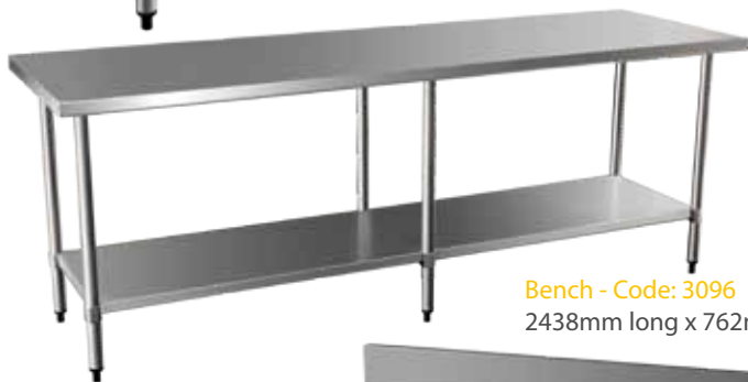
Bench - Code: 3096 2438mm long x 762mm wide