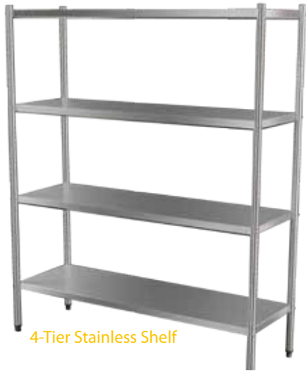
4-Tier Stainless Shelf