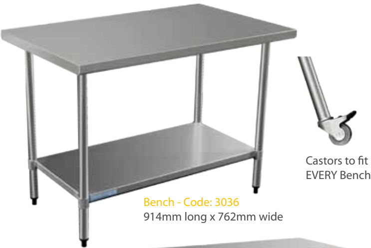
Bench - Code: 3036 914mm long x 762mm wide