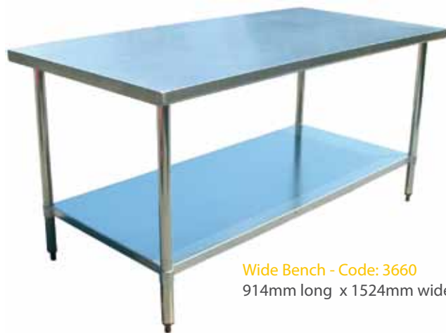
Wide Bench - Code: 3660 914mm long x 1524mm wide