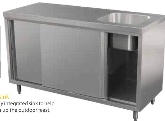
Cabsink A fully integrated sink to help wash up the outdoor feast.