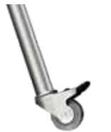
Castors to fit EVERY Bench