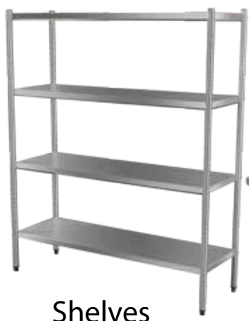
Shelves from $139.00