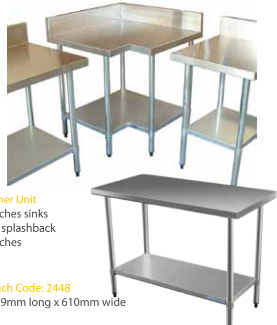
Corner Unit Matches sinks and splashback benches

Flatpack: Benches flatpack for ease-of-handling and to lower freight costs. Takes about 15 mins to erect a bench with the supplied allen-key & screws.