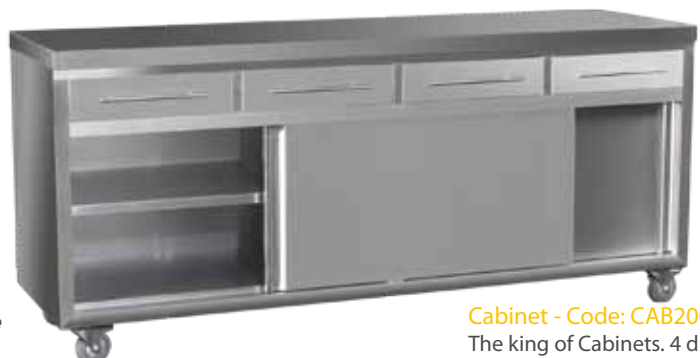
Cabinet - Code: CAB2000 The king of Cabinets. 4 drawers. Available with castors or adjustable feet.

*Prices include GST. Prices vary due to raw material and exchange rate fluctuations and are subject to change without notice.