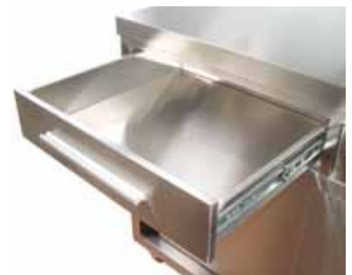
Drawer Detail Attractive Handles. Strong smooth runner. Plenty of room.