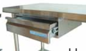
UnderbenchDrawer - DRS Single Drawer