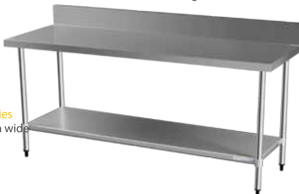
150mm Splashback Series 2000mm long x 700mm wide 150mm splashback