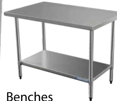
Benches from $289.00