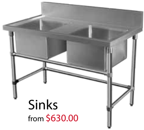
Sinks from $630.00

High Grade, Heavy-Duty Stainless - No Shortcuts!