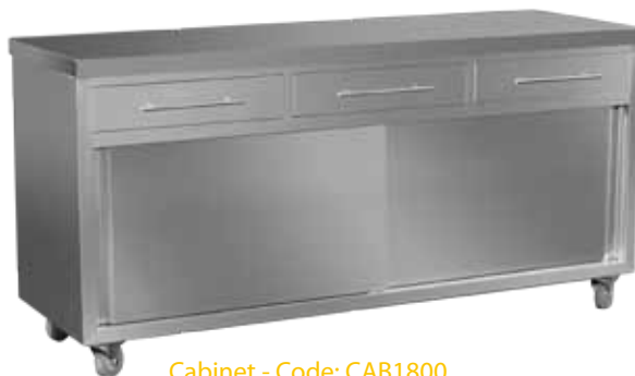
Cabinet - Code: CAB1800 On Castors. 3 Drawers. 2 Sliding Doors. 1 Internal Shelf.