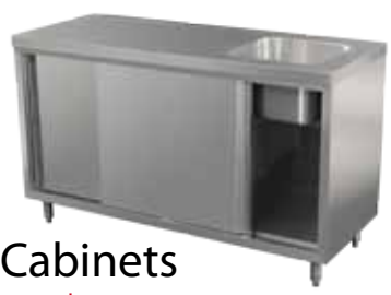
Cabinets from $1350.00