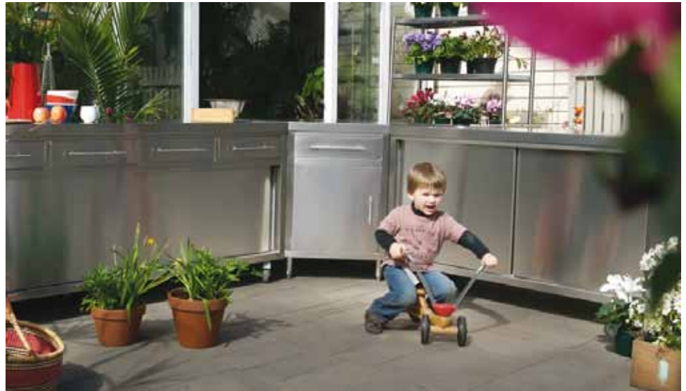
Cabinet Range The cabinet range is fully modular. We can fill almost any space and we can go around corners - just not quite as fast as 3 year-old Tom on his trike.

Castors or Feet: Cabinets can be fitted with braked castors or with adjustable feet. They are attached by a thick steel plate with 4 bolts. Bloody strong.